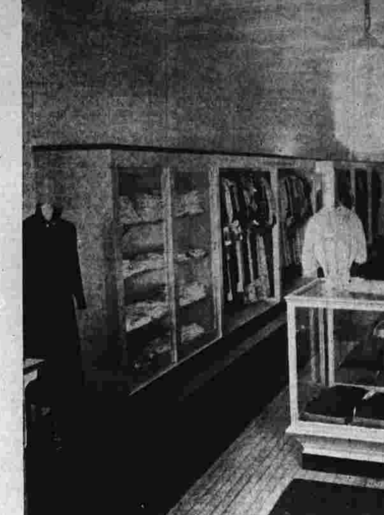
The Wilrose Dress Shop in the Hotel Sheridan building where the latest in women's Spring fashions are now being displayed. The store interior has been newly decorated and serves as a harmonious background for the Spring modes.